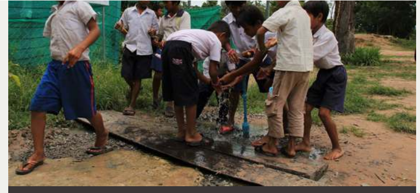
For 7 years Terre Cambodge has been working with the Foundation ADFKULEN in educations's project and developing some sustainable travel + more info.

PROJECT MADAGASCAR: (ATN) Festival of "Humpback whales" from 07<sup>th</sup> to 15<sup>th</sup> July 2018 in Nosy Boraha (Sainte Marie Island), a unique opportunity to observe its marine mammals "Humpbacks" who migrate each year in warm Malagasy waters for 4 months ( June to September). Boat trips will allow you to be in the front row to enjoy the spectacular ballets of the giants of the sea... CETAMADA <a href="https://www.cetamada.org/?lang=en">https://www.cetamada.org/?lang=en</a>: Main organiser of this event, is a Malagasy association working on the protection of marine mammals, and providing scientific and environmental support.